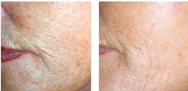
SKIN REJUVENATION - 3 TREATMENTS with Twain IPL