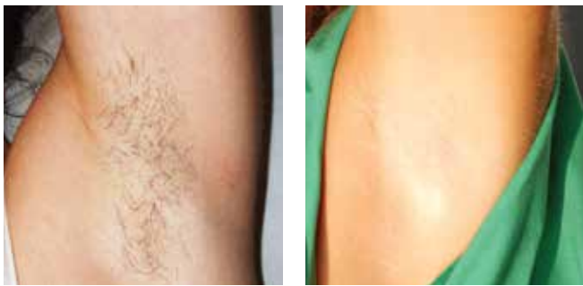
PERMANENT HAIR REDUCTION